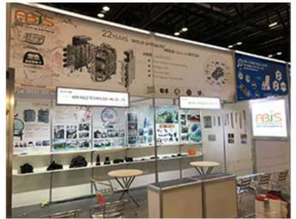
ABIS Mould packaging :