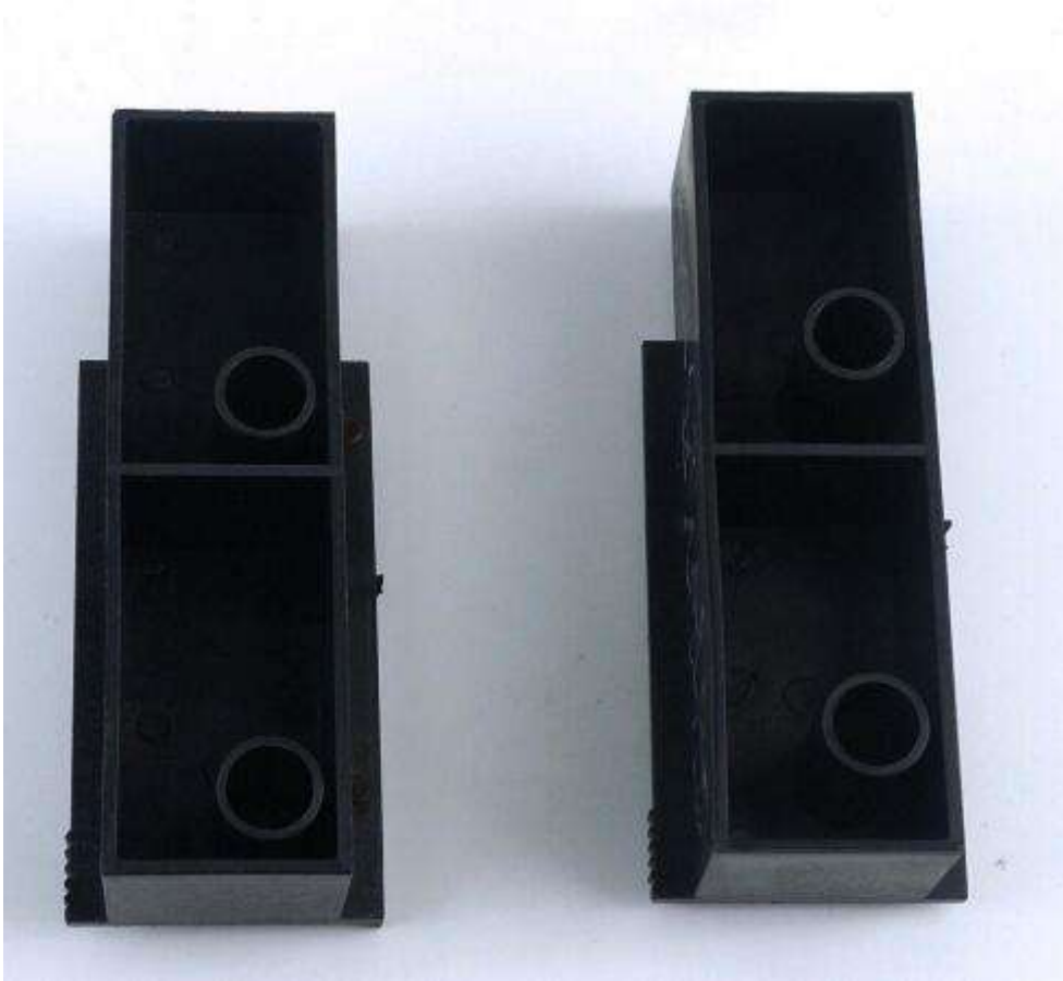
ABIS Mold order process: